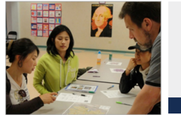
PARENT EDUCATION Parents can learn about SRTS activities via hand-outs, websites, and booths at school events.