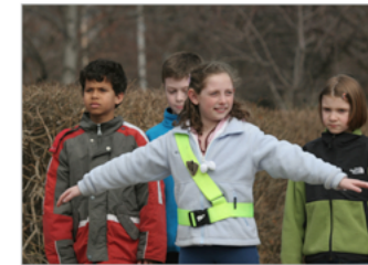
SCHOOL SAFETY PATROLS School safety patrols are trained student volunteers who assist with street crossings or school parking lot/driveway crossings.