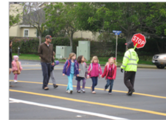
ADULT CROSSING GUARDS Crossing guards are trained adults (paid or volunteer) who are legally empowered to stop traffic to assist students with crossing the street.

Which enforcement programs would you like to see in the DGF School District? Put a sticker next to your top 3 choices.