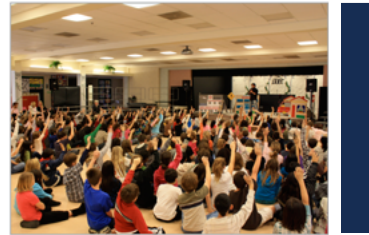
SCHOOL ASSEMBLIES Assemblies grab students' attention through fun, interactive activities such as games, skits, or demonstrations. Events can cover topics like traffic safety, health, and more.