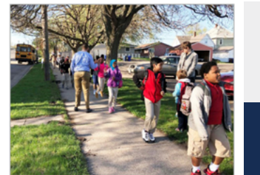
PARK & WALK A Park & Walk program encourages parents and school bus drivers to drop kids off at a set location so they can walk the rest of the way to school. This also alleviates congestion around the schools.