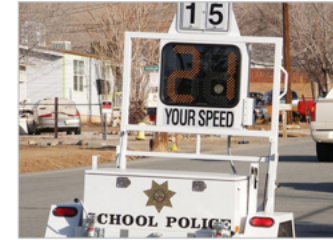
AUTOMATED ENFORCEMENT Some types of enforcement do not require the presence of a law enforcement officer such as photo detection, radar trailers, and speed feedback signs.