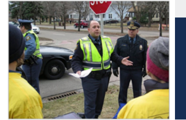
LAW ENFORCEMENT NEAR SCHOOLS Enforcement activities help reduce common poor driving behavior such as speeding, failing to yield to pedestrians, turning or parking illegally, and other violations.