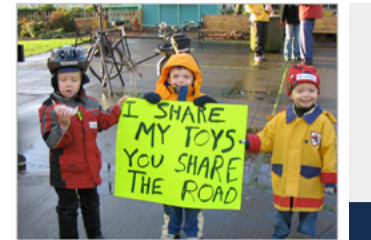
SCHOOL SAFETY CAMPAIGN A safety campaign builds awareness around students walking and biking and encourages safe driving behavior by parents and other drivers.