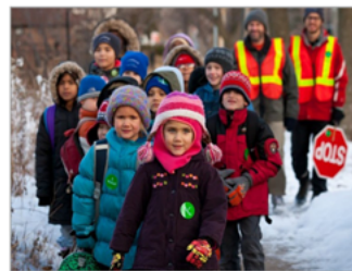
WALKING SCHOOL BUS/BIKE TRAIN Parent volunteers, older students, or other trusted adults chaperone students walking or biking to school in a group.