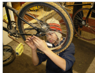
STUDENT CLUBS & EARN-A-BIKE After-school clubs can take many forms and address many different themes including bike repair, environmental issues, sport cycling, civic engagement, etc.