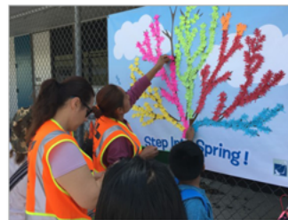
COMPETITIONS AND INCENTIVES Competitions track student trips and reward students who get involved.