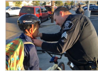
BIKE LIGHT/LOCK GIVEAWAY & HELMET FITTING Bike locks and lights are essential for students biking to school. Helmet fittings and giveaways ensure students are using their helmets correctly.