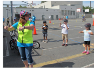
BIKE RODEO Bike rodeos teach students basic bike riding skills and help students practice riding safely to school. Bike rodeos can be held as part of a larger event or on their own.

Which education programs would you like to see in the DGF School District? Put a sticker next to your top 3 choices.