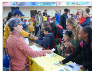
WALK & ROLL TO SCHOOL DAYS Families celebrate walking or biking to school together as part of national Walk & Bike to School Days or as local initiatives.

Which encouragement programs would you like to see in the DGF School District? Put a sticker next to your top 3 choices.