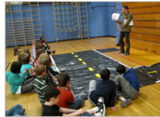
SAFETY TRAINING & CLASSROOM LESSONS Skills trainings teach students how to walk or ride bikes safely and teach the rules of the road. Lessons can also be integrated into regular classroom curriculum.