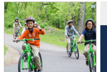
WALK & BIKE FIELD TRIPS A field trip made by foot or by bicycle gives students a supportive environment to practice skills and showcase benefits of active transportation.